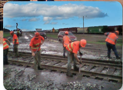
American Crystal Sugar Company Project in Hillsboro, ND

Currently, R & R Contracting has eight foremen using BUILD2WIN, and the transition from paperwork to computer work has been very well received. Sharp relays, “Our foremen enjoy the fact that each day’s information is right at their fingertips, instead of in a pile of papers.” Plus, BUILD2WIN’s straightforward, browser-based interface makes the program very easy to use—the company actually only needed one day of training to get their foremen up and running.