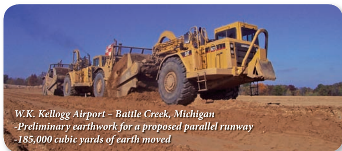
W.K. Kellogg Airport – Battle Creek, Michigan -Preliminary earthwork for a proposed parallel runway -185,000 cubic yards of earth moved