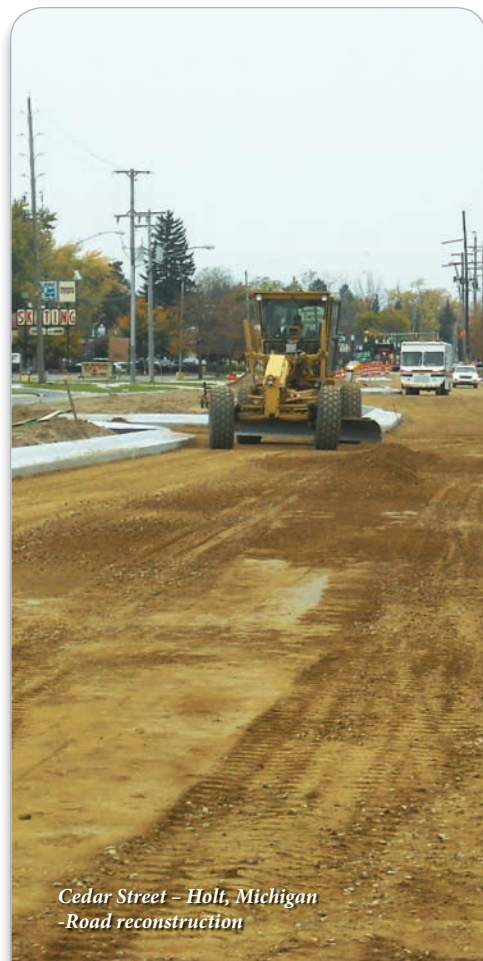
Cedar Street – Holt, Michigan -Road reconstruction

Plus, Hoffman Bros. can quickly and easily transfer job production quantities and hours to their accounting system, AMSI StarBuilder. The process of transferring field logs to payroll literally takes only seconds, says Pero, saving the company about two full days of data entry each week. Plus, BUILD2WIN eliminates the paper trail at Hoffman Bros., and the potential for errors that comes with it.